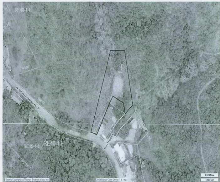
Diagram of Hazard/Location

A reinspection of your property will occur on or after the Compliance due date. If found in compliance, you will receive a written "CLEANED BY OWNER INSPECTION RECORD" for your records. If your property is not in compliance at the time of reinspection, a $320.00 (subject to change) noncompliance reinspection fee will be assessed and the City may complete the work on your behalf. The cost, including an administrative fee and the noncompliance reinspection fee will become a special assessment. Upon City Council confirmation and recordation of that order, a lien may be attached to the above parcel to be collected on the next regular property tax bill.