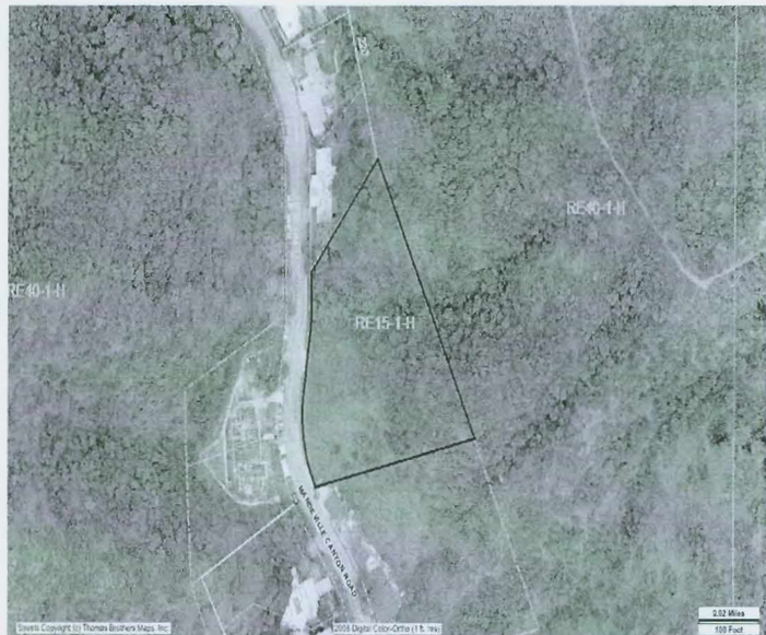
Diagram of Hazard/Location

A reinspection of your property will occur on or after the Compliance due date. If found in compliance, you will receive a written "CLEANED BY OWNER INSPECTION RECORD" for your records. If your property is not in compliance at the time of reinspection, a $320.00 (subject to change) noncompliance reinspection fee will be assessed and the City may complete the work on your behalf. The cost, including an administrative fee and the noncompliance reinspection fee will become a special assessment. Upon City Council confirmation and recordation of that order, a lien may be attached to the above parcel to be collected on the next regular property tax bill.