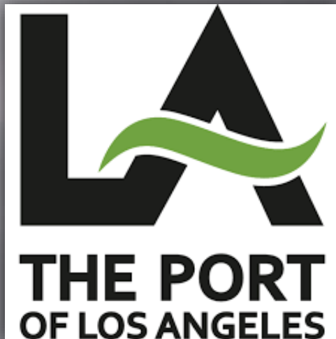
Port of Los Angeles