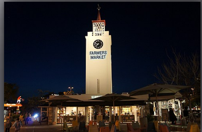
The Grove/Farmers Market