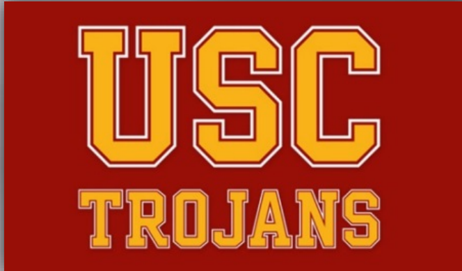
University of Southern California