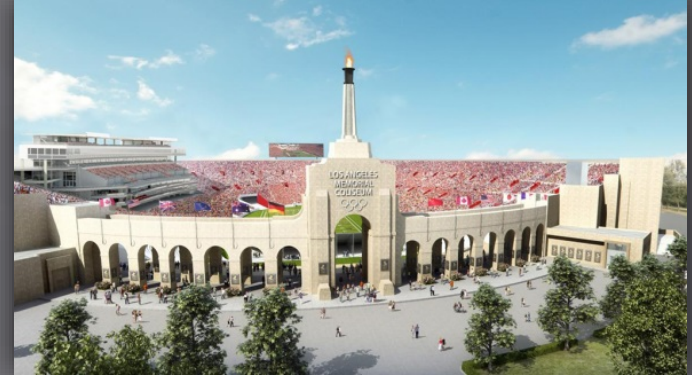
Los Angeles Memorial Coliseum & Bank of Montreal Stadium