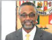
Council District 9 Current Price, Jr. Fire Stations 15, 21, 33, 46 57, 64, 65, 66