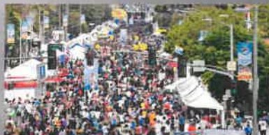
Taste of Soul