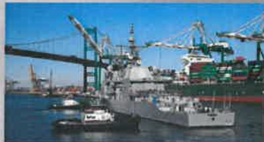
Los Angeles Fleet Week