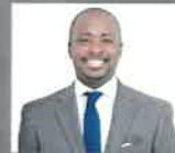
Council District 8 Marqueece Harris-Dawson Fire Stations 57, 64, 66 15, 33, 34, 46, 65, 94