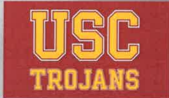
University of Southern California