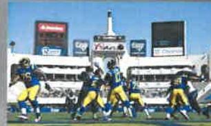
LA Rams Football