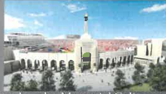
Los Angeles Memorial Coliseum & Banc of California Stadium