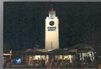
The Grove/Farmers Market