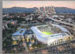
Banc of California Stadium Los Angeles Football Club