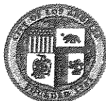
ERIC GARCETTI MAYOR

DEPARTMENT OF TRANSPORTATION 100 South Main Street, 10 th Floor Los Angeles, California 90012 (213) 972-8470 FAX (213) 972-8410