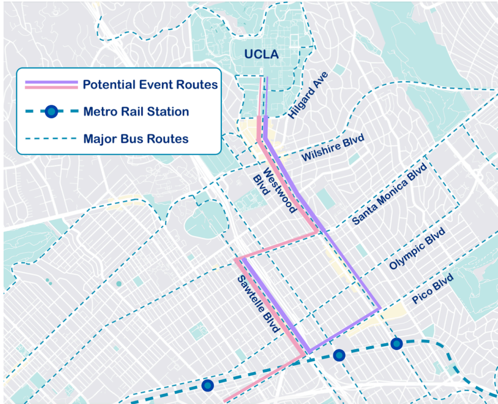
Figure 1. Potential routes for a Westwood-Sawtelle CicLAvia event with total lengths of 3-4 miles.