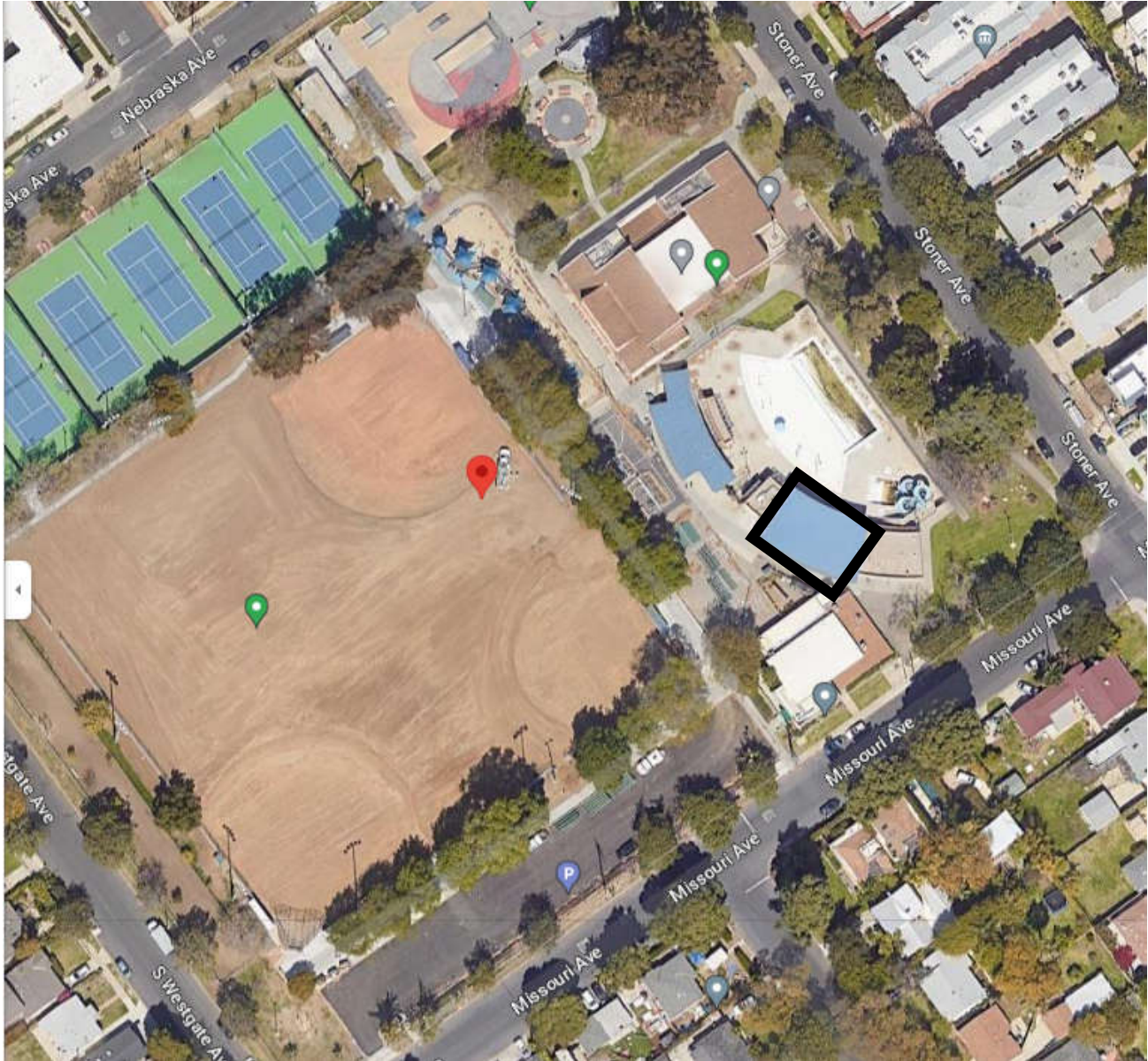
Stoner Park – Small gym (south of main building) – 1835 Stoner Ave.