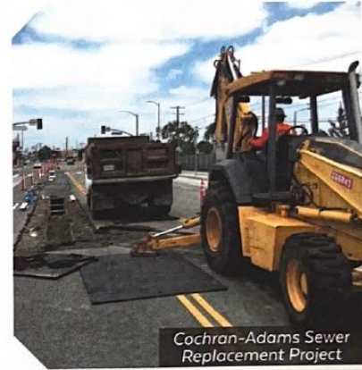
Cochran-Adams Sewer Replacement Project