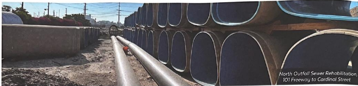
North Outfall Sewer Rehabilitation, 101 Freeway to Cardinal Street