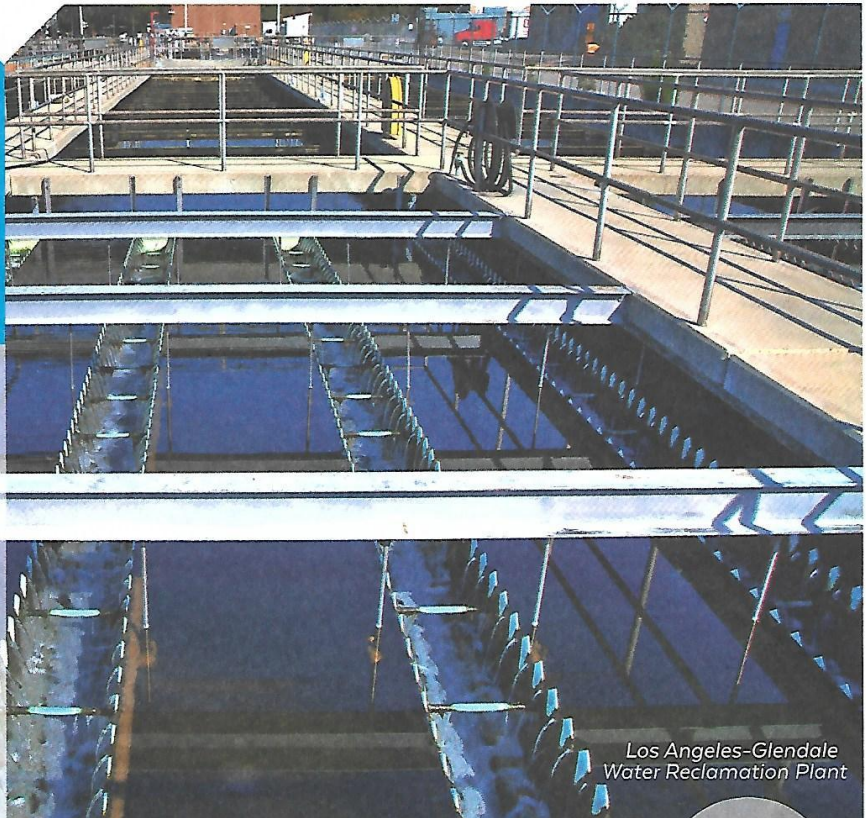
Los Angeles–Glendale Water Reclamation Plant

Los Angeles City Hall John Ferraro Council Chamber, Room 340 200 North Spring Street, Los Angeles, 90012