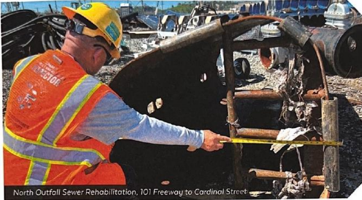
North Outfall Sewer Rehabilitation, 101 Freeway to Cardinal Street