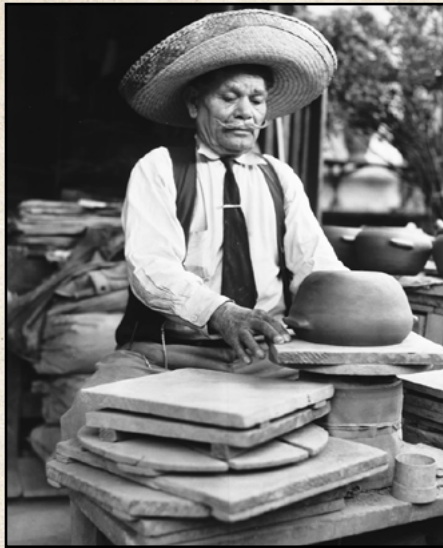
Portrait of a potter on Olvera Street (ca. 1940s)

El Pueblo is currently seeking proposals to operate a flower shop and a straw artisan concession in the plaza area. We have heard from a number of merchants who wish to have artisans return to Olvera Street and to provide goods that do not compete with existing merchandise. As we all know, a healthy business district requires the cooperation from every shop and restaurant, big and small. If we work together and not duplicate our sales items, everyone will do good business.