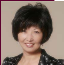
Commissioner Helen Han

LACCSW board members will discuss these recommendations in more depth at an upcoming retreat. This promises to be the first of several dialogues with the women of City Council.