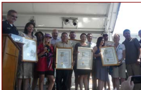
Local dignitaries present awards at the 7th Annual Deaf Festival at Woodley Avenue Park in Council District 6