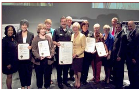
Local dignitaries celebrate 100 years of women in the LAPD, sworn to protect and to serve