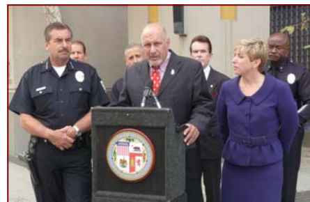
Councilman Zine joins LAPD Chief Beck and Controller Greuel at a press conference regarding an audit of the red light program