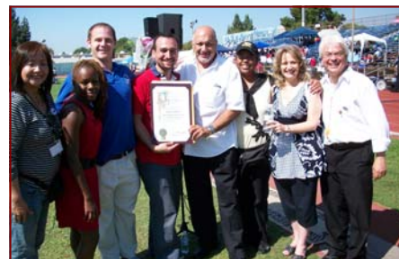
Soka Gakkai International-USA's "Heroes of the World: Raise the Banner of Victory!" family fun celebration