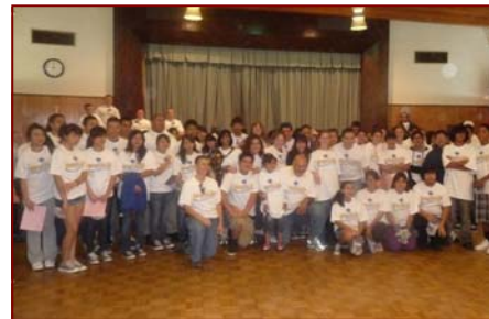
170 volunteers from around Reseda joined Councilman Zine for a community cleanup with Revitalize Reseda