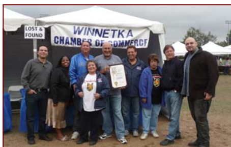
Members of the Winnetka Chamber of Commerce and the Winnetka Neighborhood Council enjoy the 2010 Oktoberfest