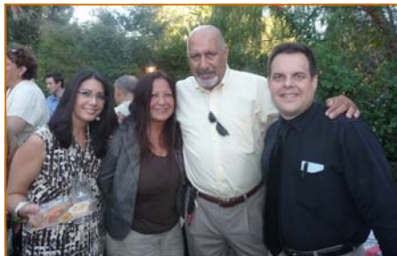
The Canoga Park/West Hills Chamber of Commerce hosts an LAPD West Valley Jeopardy Fundraiser at the Hidden Chateau