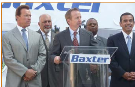
Councilman Zine, Gov. Schwarzenegger, Mayor Villaraigosa, and Dep. Mayor Beutner announce the new Business Tax Holiday