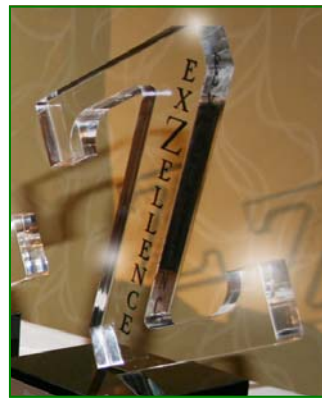
The Z Award for Excellence