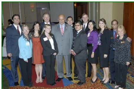
The Z Team celebrates yet another successful Z Awards for Excellence Luncheon honoring public safety personnel