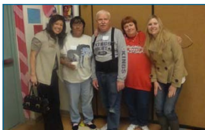
Four of Santa's most dedicated elves take a break from the afternoon's holiday festivities