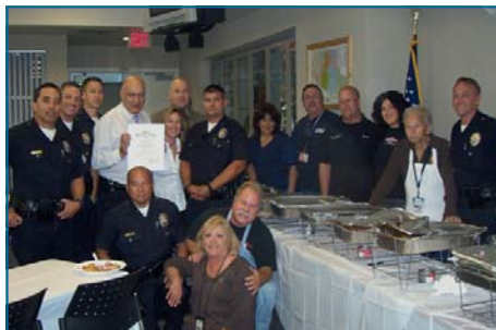
Community members celebrate Officer Appreciation Day at the West Valley Police Station in Reseda