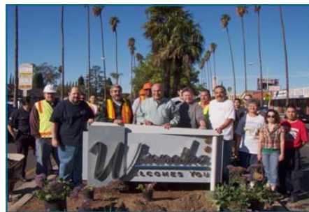
Winnetka Neighborhood Council Median Project on Sherman Way