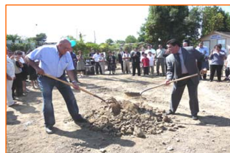
The ceremonial groundbreaking at the Iglesia Poder de Dios in Reseda