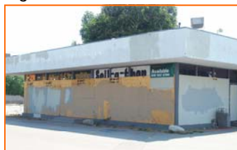
A former car dealership was the site of the graffiti sting in Reseda

That night, we set up the sting operation for the normal hours of 9pm to 2am at the dealership. Within about 20 minutes, one of the under-