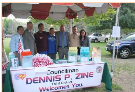
Council District Three staffers man the booth at the Annual National Night Out celebration