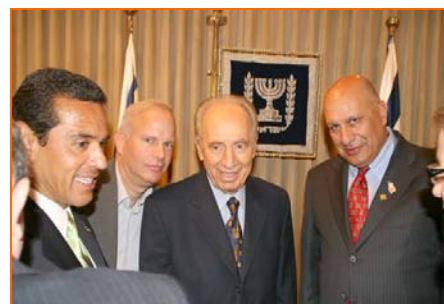
Councilman Zine with Mayor Villaraigosa and President Shimon Peres of Israel