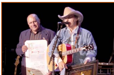
Dwight Yoakam is honored at Go Country 105.1FM's Summer Under the Stars Concert