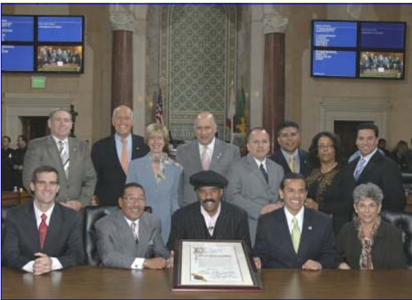
LA City Council and Controller honor actor and comedian Steve Harvey.