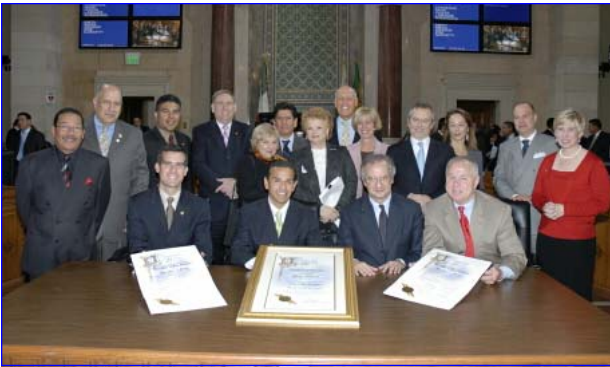
Consul General of Italy, Diego Brasioli and the Mayor of Rome, Walter Veltroni meet with the Mayor and City Council.