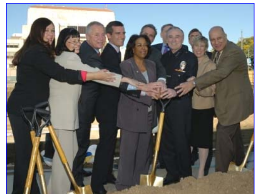
LAPD Chief William Bratton and LA City Councilmembers and members from the Public Works Commission at the new LAPD headquarters groundbreaking.