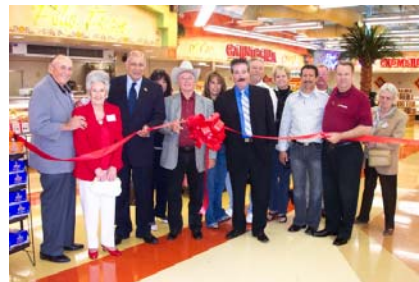
Vallarta Supermarket opens its doors at Vanowen and Corbin