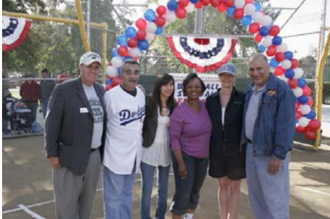
Councilman Zine at Reseda Park for Opening Day of the Little League season