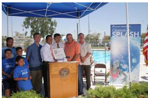
The summer is kicked off with a splash at the opening of Lanark Pool in Canoga Park