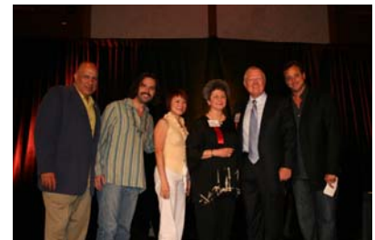
Councilman and friends attend the Annual Valley Village Luncheon