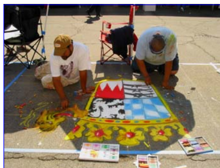
Some of the artists demonstrating their skills at chalk art.