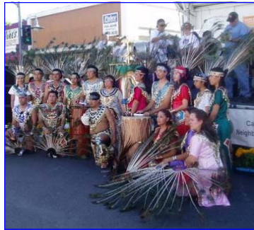
Aztec dancers perform for the crowd at the Dia de Los Muertos Festival.

Dia de los Muertos or Day of the Dead is a celebration of life and not death as the name states. This tradition dates back to Pre-Hispanic times when the Aztecs viewed death as a transition to higher form rather than simply an end of existence. In modern times, Mexicans as well as other Latinos celebrate Dia de los Muertos as a way of commemorating the dead.