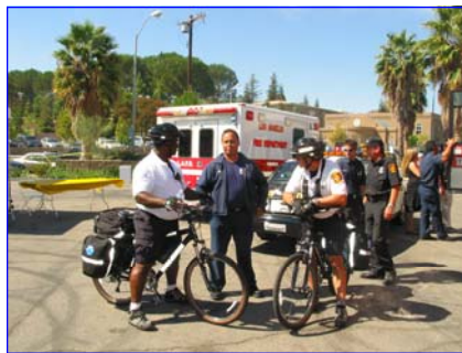
LAPD & LAFD helping to keep all who attended the West Hills Fall Fest safe.

High School Jazz Band, West Valley Music All Stars, Golden Performing Arts Center, Cutting Edge Karate, Guadalupe Folklorico, and El Camino Marching Band provided some of the entertainment, while local vendors including Corn Cobbler, It's in the Sauce, Hawaiian Delight, and Quiznos provided tasty treats for everyone to enjoy.