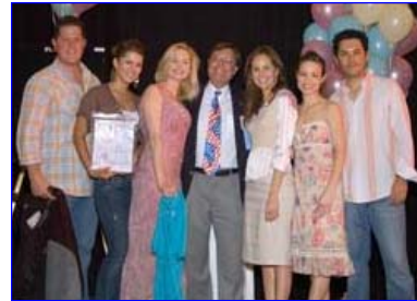
Cast of day time Soap Opera, General Hospital, ABC Channel 7.