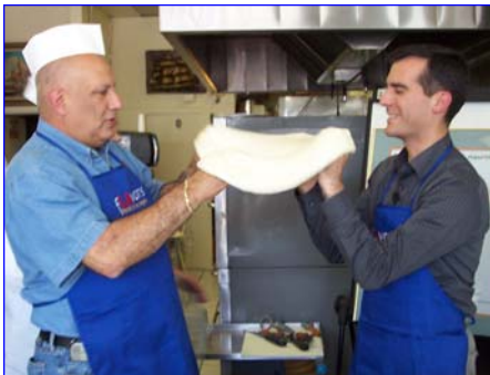
The "Toss" Be carefull

From there it's just a short walk to the Pizza Plus Company, where the councilmen don aprons, choose ingredients, and yes, actually toss pizza crusts into the air in hopes of creating the perfect pizza pie. Do they catch them? You'll have to watch to find out!