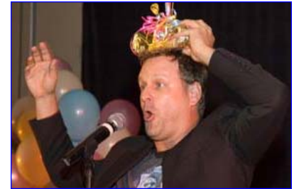
Comedian Dave Coulier