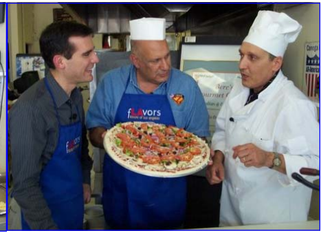
Ahhh, the "Final Product—Pizza Plus!

The day ends with a fine dining experience at Brandywine, an intimate continental restaurant in Woodland Hills, where the fare includes crab cakes, cioppino, salmon mousse, scallops, filet mignon, rack of lamb, and many more delectable dishes.