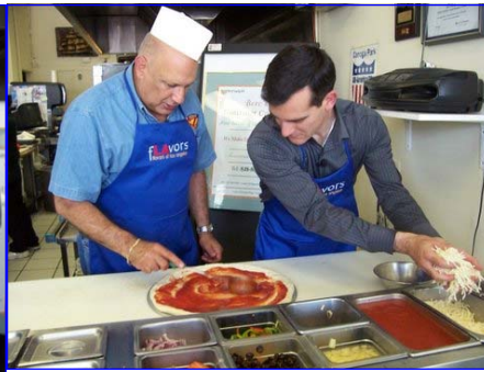
The "Sauce" - No Fuss