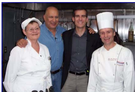
Councilmember's Dennis P. Zine & Eric Garcetti with the Executive Chefs at Brandywine Restaurant

The day ends with a fine dining experience at Brandywine, an intimate continental restaurant in Woodland Hills, where the fare includes crab cakes, cioppino, salmon mousse, scallops, filet mignon, rack of lamb, and many more delectable dishes.