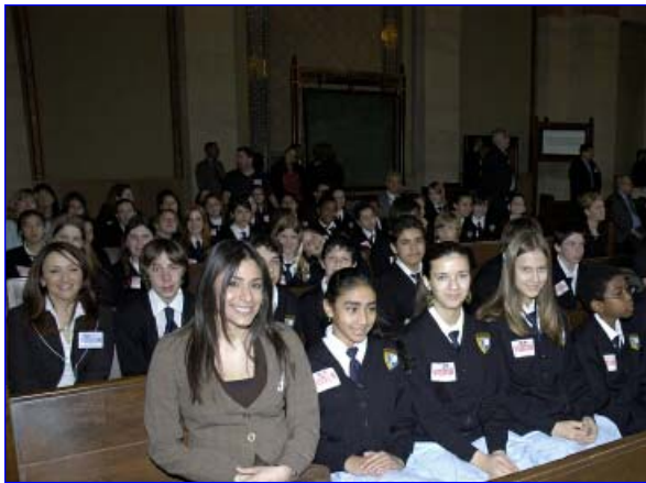
Students from Ivy Academia Charter School in Woodland Hills tour City Hall and attend an LA City Council Meetings.