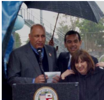
Rain or shine, City comes 1st. Councilman Dennis P. Zine, Mayor Villaragosa and Sandy Kievman from the City Attorney's Office at a press conference for the re-opening of swimming pools in the City of Los Angeles.

have all been tapped into to raise the $6.2 million needed to complete this project.