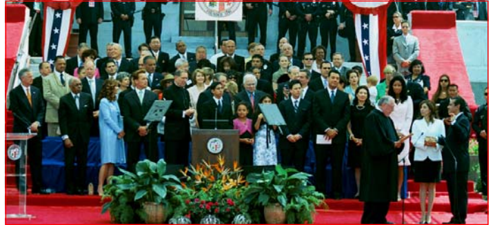
Mayor Antonio Villaragosa swearing in along with the City Council, Vice President Al Gore, Governor Arnold & Maria Schwarzenegger, Father Mahoney, Reverend Jesse Jackson and many other dignitaries.