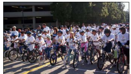
The start of the bicycle race.

http://www.fitnesschallengeinfo.com/conference.html .