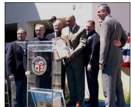
Councilman Smith, Chief Bratton, Captain Sherman, Councilman Zine and Mayor Hahn.

The new state of the art facility, that replaces the old station built in 1960, is inviting and offers conference rooms and patio areas for public use. 219 officers, 62 detectives and 61 civilians will work out of the West Valley Station. If you need to contact the station, the non-emergency number is 818-374-7617 or you may call 877-ASK-LAPD or 311.