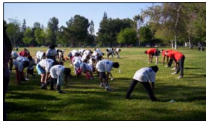
Kids warming up to begin the race.

Admission was free for all of those who wished to participate in the Challenge. Grants were also awarded to the schools with the most participants who funded their efforts to improve the health of their students.