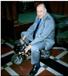
Councilman Dennis P. Zine on a Pocket Bike in Council.

These dangerous machines may look like toys, but they are hell on wheels. My goal is to see that everyone, riders and public alike know the law. It seems only logical that the city should do what it can to regulate pocket bikes that allow residents, most often children, to ride at high speeds only inches off the ground.