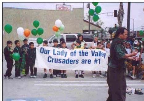
Students from Our Lady of the Valley Catholic School attended the Annual St. Patrick's Day Parade along Sherman Way.