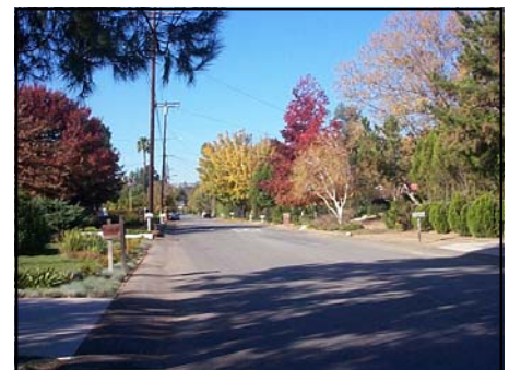
The beautiful Autumn colors of Walnut Acres.

With very little hesitation, the Planning Department denied the lot split.