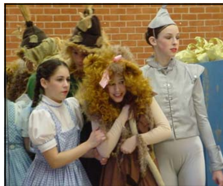
Actors from the Wizard of Oz which will be playing at the Madrid Theatre on December 14th & 15th.