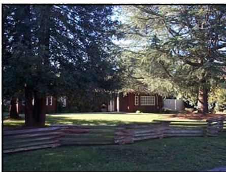
Typical Ranch Style houses as this one are prevalent throughout Walnut Acres.

On October 7 th , 2004 Councilman Zine asked his planning staff to speak at a public hearing to oppose a “flag” lot split proposed at 23141 Burbank Boulevard. This proposal is located in a neighborhood of Woodland Hills affectionately known as Walnut Acres. It is an area of beautiful homes, some of which have horse keeping and other agricultural uses.