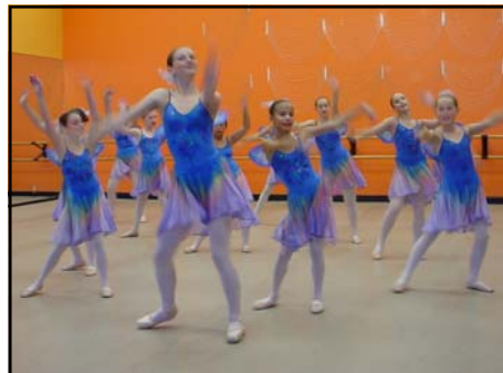
Members of the Los Angeles Youth Ballet, Junior Company.

This is a great example of the CRA's business attraction program at work, bringing positive, desirable businesses into neighborhoods. The Ballet Academy will bring art, culture, and education to the Reseda Business Corridor. This serves as a place for kids to come together in the community, and to stay off of the streets, by engaging in a creative outlet.