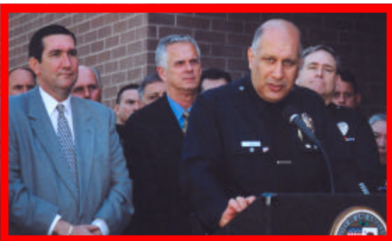
LAPD Reserve Officer Zine, Mayor Hahn and Councilmember Smith showing support for the LAPD Reserve Program.