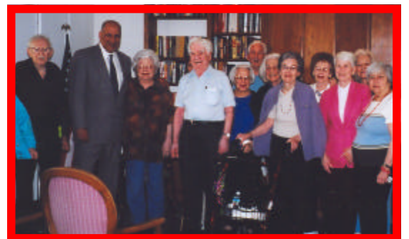
Councilman Zine visits with Seniors of the Pacific Gardens Retirement Home to discuss a variety of issues.