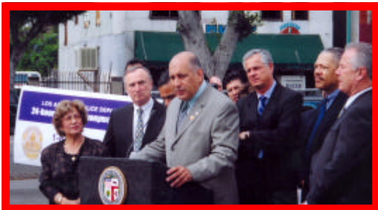
Councilman Zine along with LAPD Chief Bratton, Mayor Hahn and Councilman LaBonge at a News Conference announcing