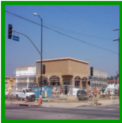
The new CVS Pharmacy on Reseda Blvd. at Valerio Street in the Community of Reseda.

The community of Reseda appears to be sparking an interest with developers as applications for development requests seem to be increasing in this area. As it turns out, the planning updates for the month of September all happen to be in Reseda.