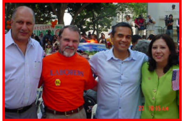
Councilmember's Zine & Villaragosa at a Rally at City Hall.