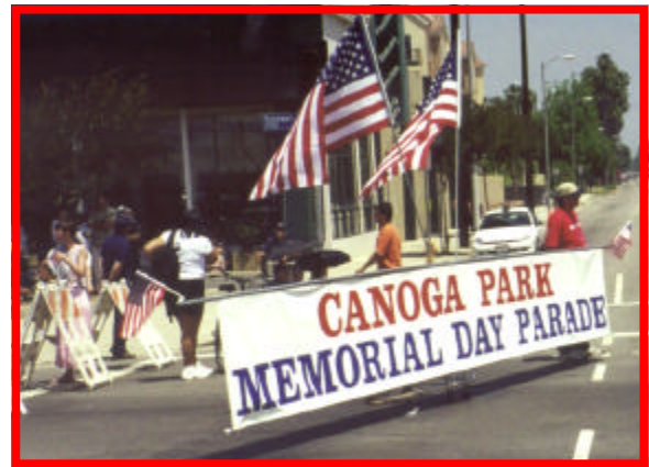
The Canoga Park Memorial Day Parade begins.