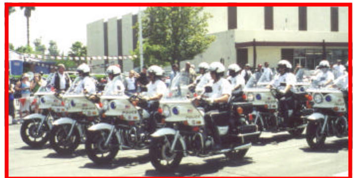
LAPD Motorcycle Drill Team performs at the Canoga Park Parade and at the Choir Boys Crush Domestic Violence Motorcycle Ride raising money for Haven Hills Battered Women's Shelter.