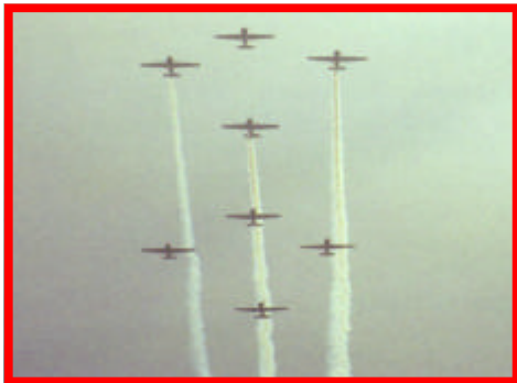
Military Fighter Jets flyover Canoga Park announcing the start of the 15th Annual Canoga Park Memorial Day Parade.