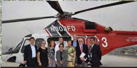
Federal officials of the America's Great Outdoors initiative visit the River