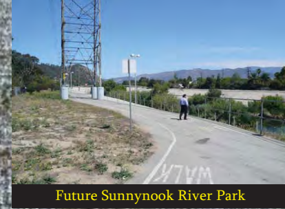
Future Sunnynook River Park