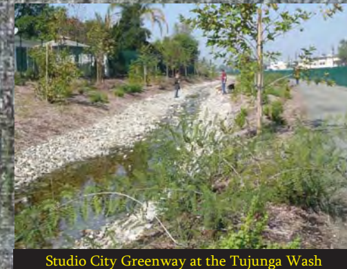
Studio City Greenway at the Tujunga Wash