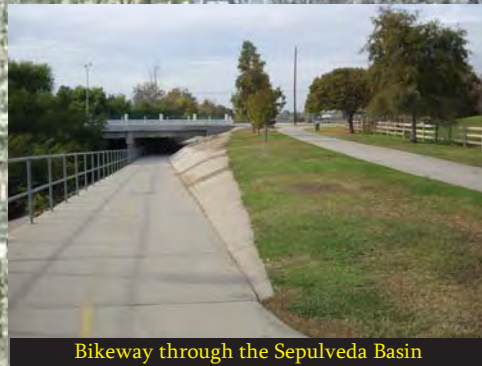
Bikeway through the Sepulveda Basin