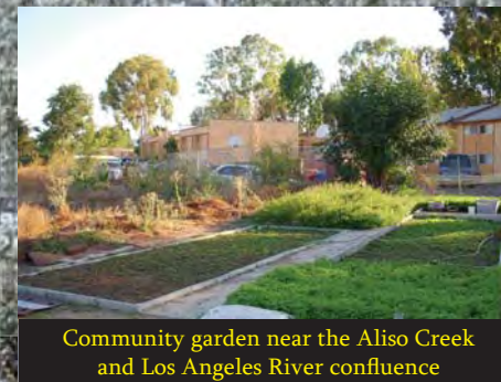
Community garden near the Aliso Creek and Los Angeles River confluence