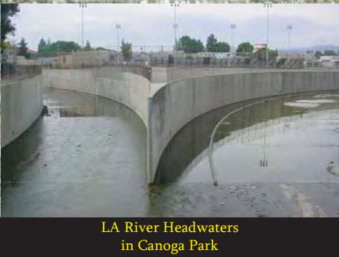
LA River Headwaters in Canoga Park