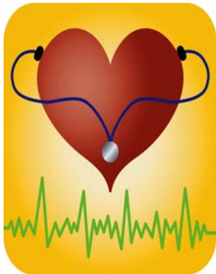
Blood Pressure Screening