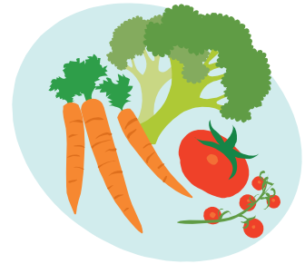
Health Education Materials

Saturday November 14, 2009 9:00 a.m. - 4:00 p.m.