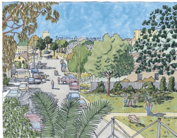
BOYLE HEIGHTS GREEN CORRIDORS

My office is leading the Boyle Heights Green Corridor Project, a collaborative effort between a variety of public and nonprofit agencies, including teachers and students from Hollenbeck Middle School, Mountains Recreation and Conservation Authority, and the office of County Supervisor Gloria Molina, and Assembly Speaker Fabian Nuñez. This project seeks to create a green corridor linking the Blueberry Hill steps with Hollenbeck Park along Sixth Street allowing for street greening, parks, stormwater management, and installation of recreational park amenities. This project will serve to bring recreational improvements and native ecology to the densely populated Boyle Heights neighborhood. I am working to bring $500,000 in Community Development Block Grant funds to this project to realize the vision of creating a cleaner, greener, and environmentally sustainable corridor.