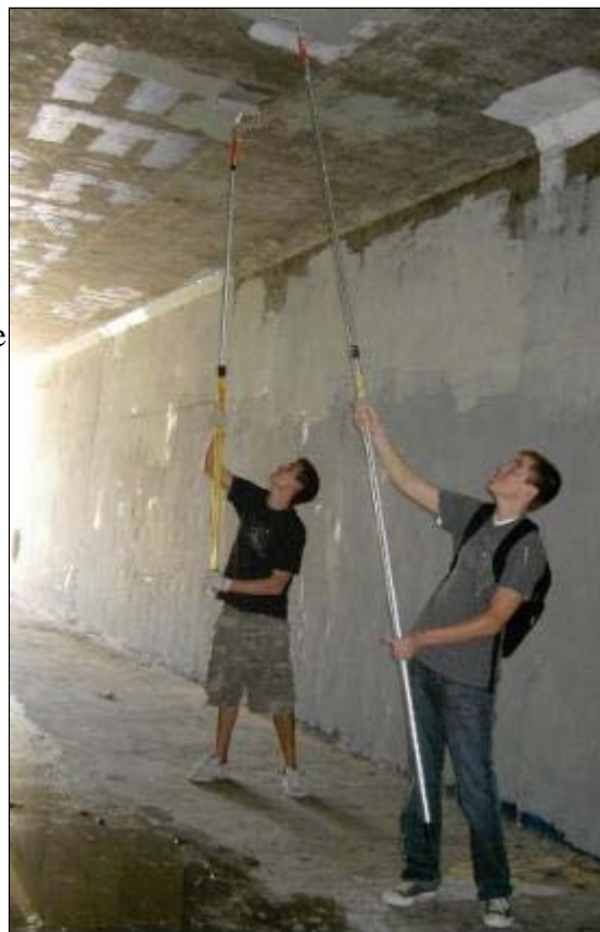
Painting over graffiti at Limekiln Canyon.