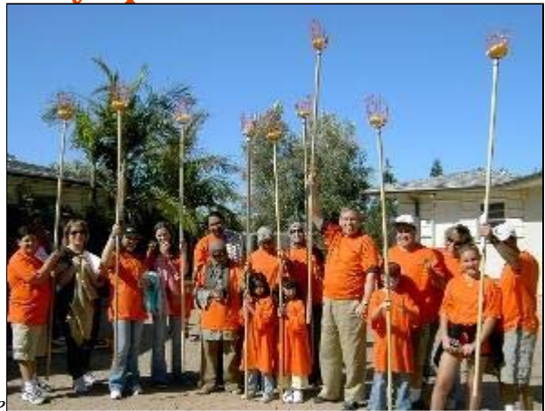
At last year's Citrus Sunday event, more than 140 volunteers participated.