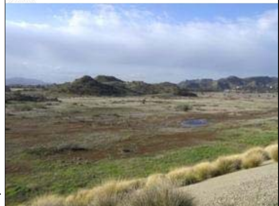
Chatsworth Nature Preserve is the only nature preserve within the City boundaries.