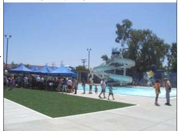
The shallow pool with special equipment for children and people with disabilities, and the amazing two story high waterslide donated by Kaiser Permanente.