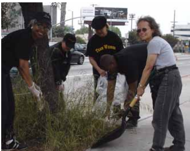
Day of Service 2006.....pg. 3