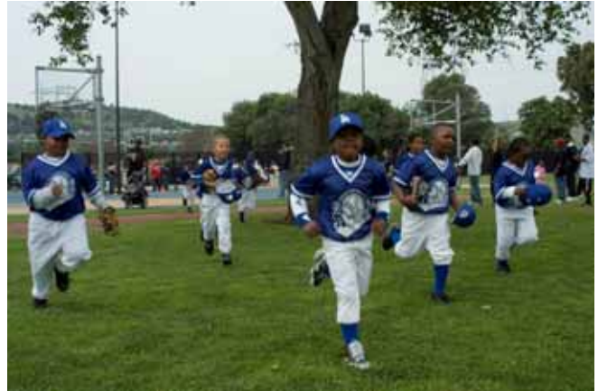
Play Ball!.....pg. 13