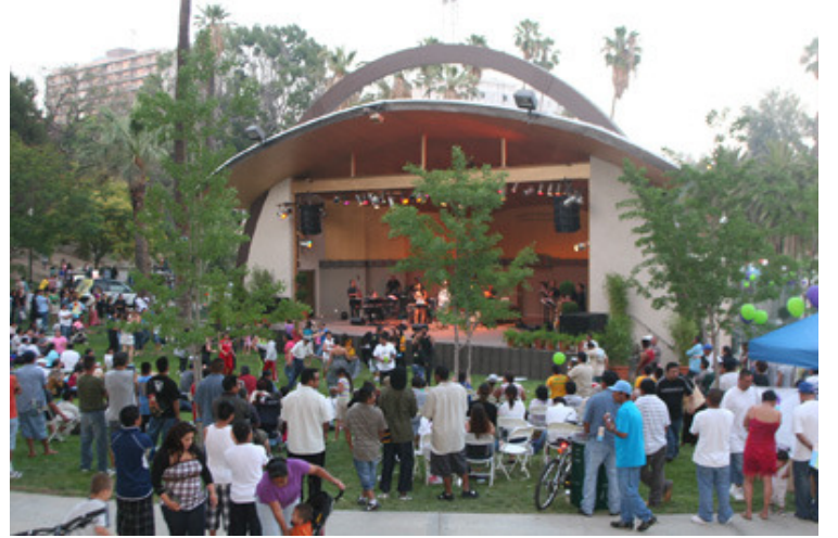
Want to enjoy soulful rhythms while the sun sets? Or dance to compelling Latin dance beats? Or enjoy Grammy-nominated live music with your family picnic?

You can enjoy all this for free at the MacArthur Park bandshell, thanks to the 2008 Summer Concert Series made possible by the Levitt Foundation.