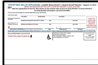
(OSB back cover)

For further information or assistance, please contact the Office of the City Clerk - Election Division between 8:00 a.m. and 5:00 p.m., Monday through Friday, at (213) 978-0444 or toll-free at (888) 873-1000.