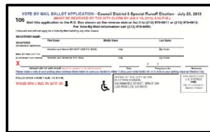
(OSB back cover)

In addition, the Election Division has mailed letters to those voters whose polling places have changed since receiving their OSB.