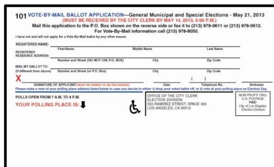
(OSB/VIP back cover)