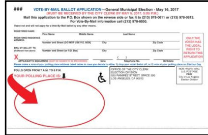
(OSB back cover)

For further information or assistance, please contact the City Clerk - Election Division between 8:00 a.m. and 5:00 p.m., Monday through Friday, at (213) 978-0444 or toll-free at (888) 873-1000.